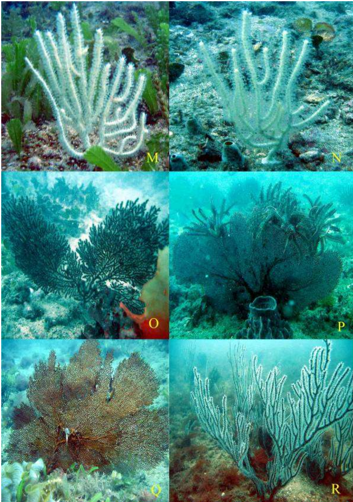
Figure 3 M, N - Menella sp., O - Paracis sp., P, Q - Annella reticulata , R - Subergorgia suberosa .