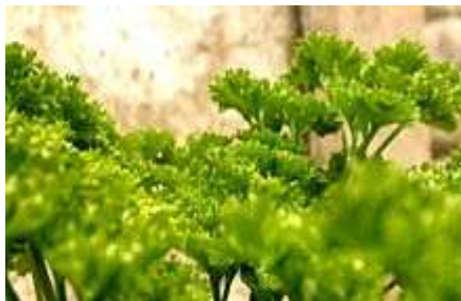
Figure 1: Parseley

seeds are ovoid, 2–3 mm long, with prominent style remnants at the apex. One of the compounds of the essential oil is apiol. The plant normally dies after seed maturation.