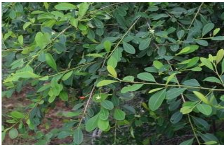
Figure 1: Erythroxylum monogynum